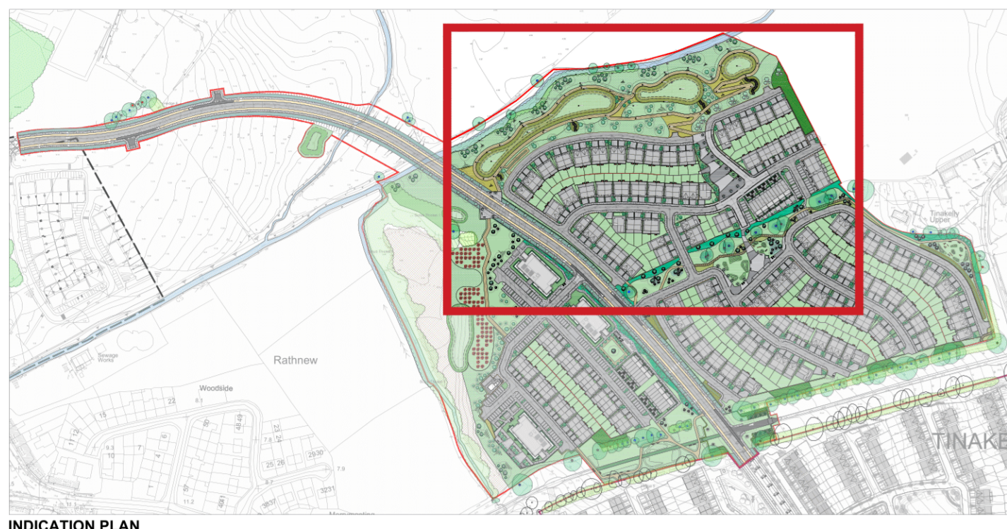
INDICATION PLAN SCALE: 1:5000/A1